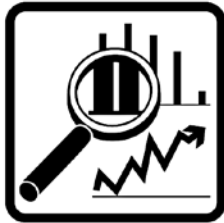
Figure 1. Key domains for transforming the nation’s health and providing individuals with equitable opportunities to take charge of their health.