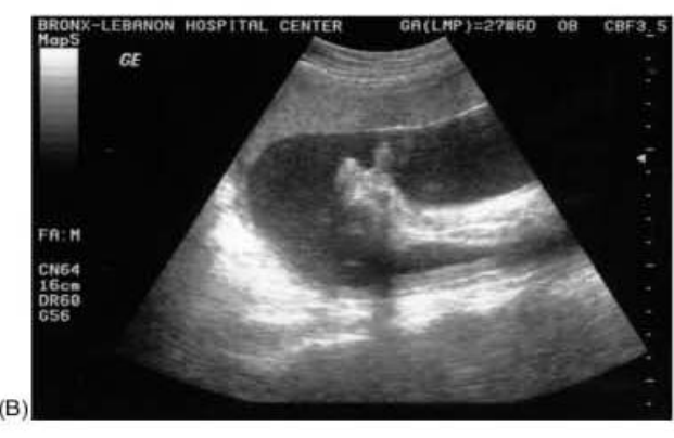
Figure 5—(A) Clubfoot deformity with sandal-gap toe (at autopsy); and (B) clubfoot deformity with sandal-gap toe (on ultrasound)

1998) have been reported. These families offer evidence that the condition is panethnic.