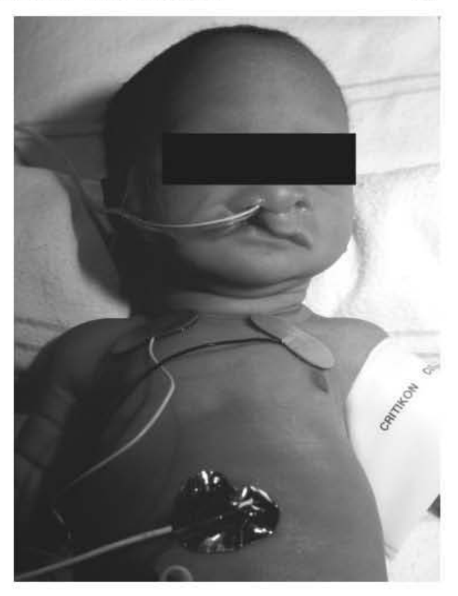
Figure 3—Cleft lip

At 33 weeks, the patient complained of decreased fetal movement and ultrasound confirmed an intrauterine fetal demise. Induction was undertaken and a 1050 g (<5th percentile) macerated female stillborn