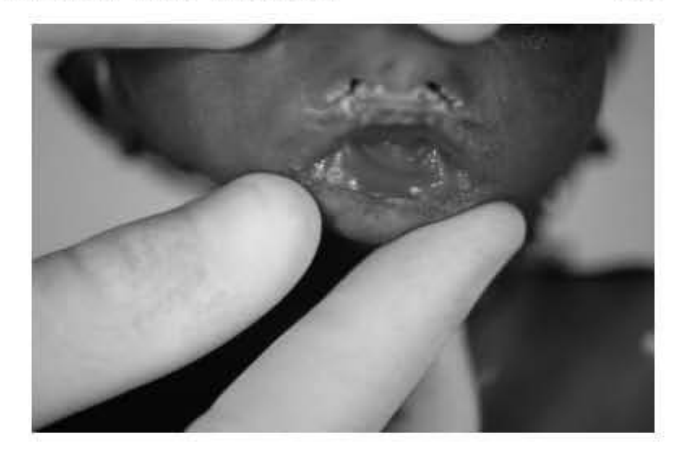
Figure 6—Filiform bands connecting the lower lip with the maxilla (at autopsy)

Di Stefano G, Romeo MG. 1974. La Sindrome Dello Pterigio Popliteo (Contributo Casistico). Riv Pediatr Sic 29: 54-75.